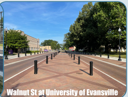
Walnut St at University of Evansville