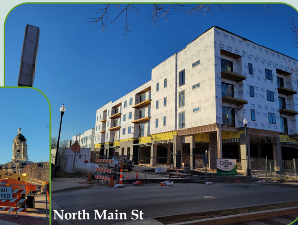
North Main St