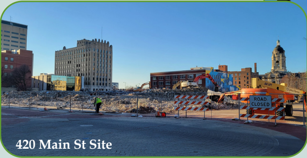
420 Main St Site

Construction continues on North Main Street at the site of the former IGA grocery store. Four separate three- and four-story buildings are being erected on the block at the northwest corner of North Main Street and Illinois Street. The development will include a mix of apartments for different income ranges and ground floor commercial space. Sidewalk closures and construction fences will continue in the area until completion, which is expected sometime in 2022.