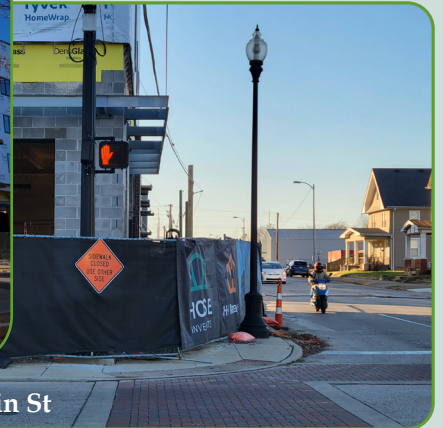
North Main St